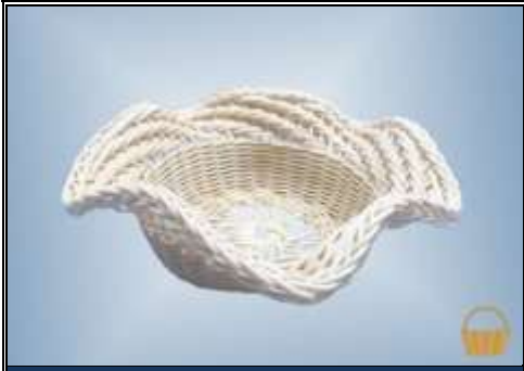
3 1/2" H X 8" D Intermediate

Class: FR-6-16 $ 44.00 Friday 8:00-3:00 6 Hrs.