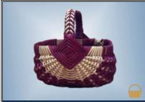
6" W X 6" H w/handle Intermediate

Class: FR-6-17 $ 50.00 Friday 8:00-3:00 6 Hrs.