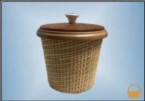
9" H X 7" D Intermediate

Class: ST-8-35 $ 200.00 Saturday 8:00-5:00 8 Hrs.