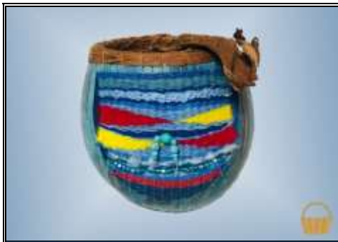
6" L X 5" W X 6" H X 6" D All Levels

Class: FR-8-25 $ 70.00 Friday 8:00-5:00 8 Hrs.