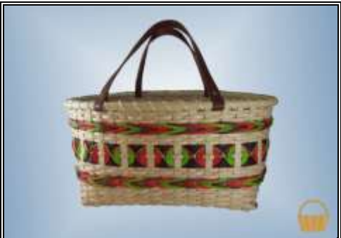
17" L X 12" W X 12" H w/o handle Intermediate

Class: TH-4-8 $ 42.00 Thursday 1:00-5:00 4 Hrs.