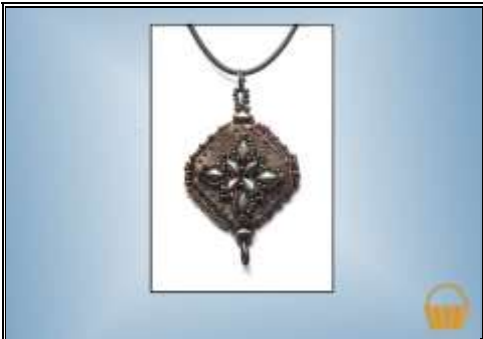
2" W X 2 3/4" H All Levels

Class: ST-6-31 $ 45.00 Saturday 8:00-3:00 6 Hrs.