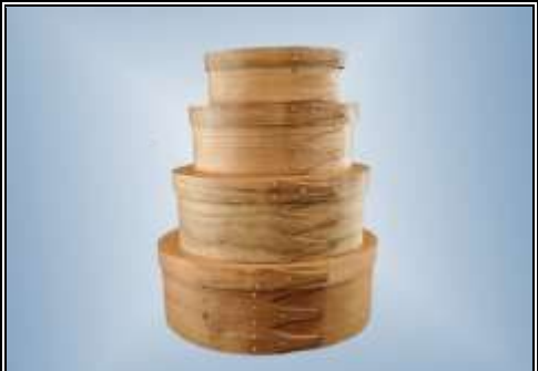
8 1/2" L X 5 3/4" W X 1 1/2" - 4" H All Levels

Class: TH-FR-12-11 $ 85.00 Thursday 1:00-5:00 12 Hrs. Friday 8:00-5:00