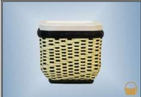
4" L X 4" W X 4" H Intermediate

Class: TH-4-3 $ 65.00 Thursday 1:00-5:00 4 Hrs.