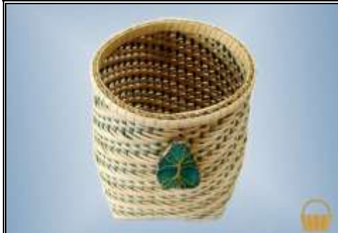
13" H X 8" D Intermediate

Class: ST-SN-10-28 $ 125.00 Saturday 8:00-5:00 10 Hrs. Sunday 8:00-10:00