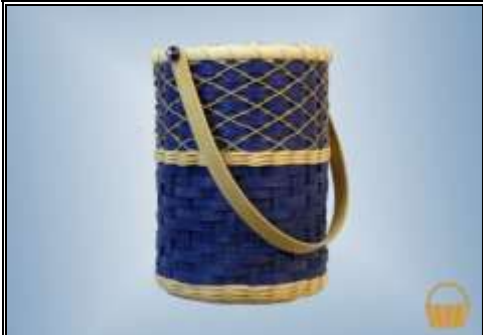
10" H X 7" D w/o handle Intermediate

Class: FR-8-22 $ 95.00 Friday 8:00-5:00 8 Hrs.