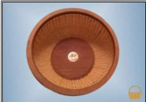
5" H X 10" D Intermediate