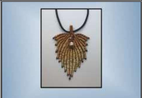
Sizes Vary Advanced Beginner

Class: TH-FR-12-10 $ 125.00 Thursday 1:00-5:00 12 Hrs. Friday 8:00-5:00