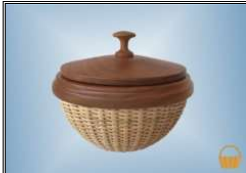
5 1/2" H X 5" D Beginner

Class: TH-4-2 $ 150.00 Thursday 1:00-5:00 4 Hrs.