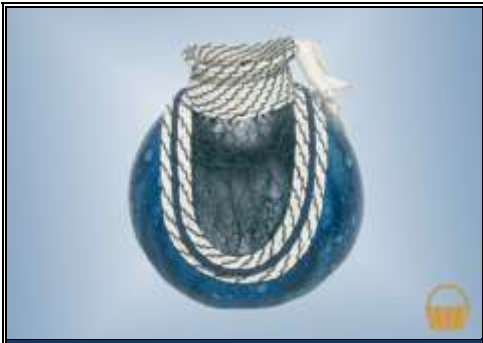
8" L X 8" W X 9" H X 10" D All Levels

Class: FR-4-13 $ 65.00 Friday 8:00-12:00 4 Hrs.