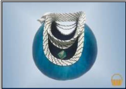
8" L X 8" W X 9" H X 10" D All Levels