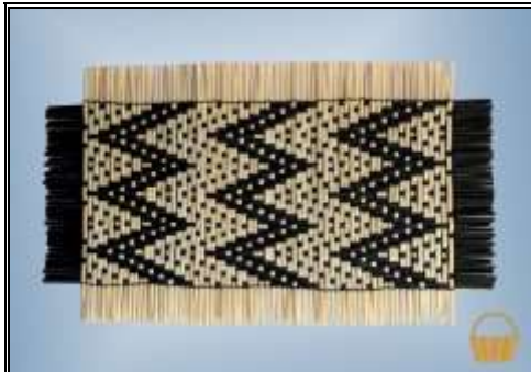
16" L X 9 1/2" W Advanced

Class: TH-4-1 $ 42.00 Thursday 1:00-5:00 4 Hrs.