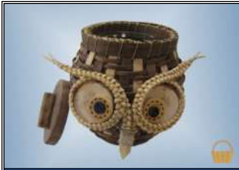
6 1/2" L X 6 1/2" W X 6 1/2" H X 6 1/2" D Advanced Beginner

Class: FR-4-14 $ 70.00 Friday 1:00-5:00 4 Hrs.