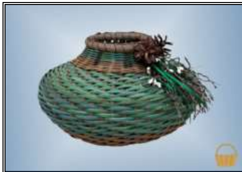
6" H X 9 1/2" D Intermediate