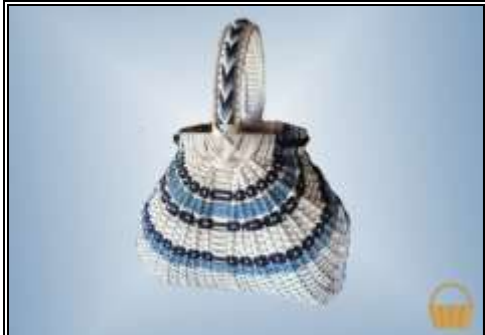
18" L X 14" W X 16"-18" H w/handle Advanced

Class: TH-FR-12-9 $ 100.00 Thursday 1:00-5:00 Friday 8:00-5:00 12 Hrs.