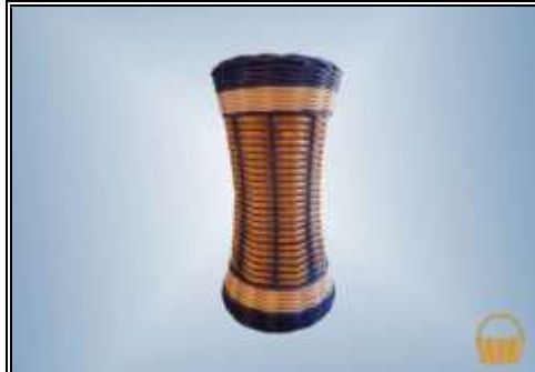
9" H X 4" D Intermediate

Class: TH-4-5 $ 70.00 Thursday 1:00-5:00 4 Hrs.