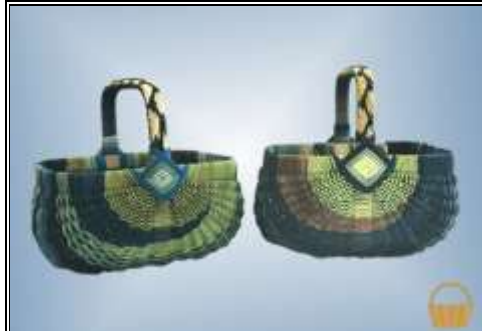
10" W X 10" H w/handle Advanced

Class: ST-4-27 $ 80.00 Saturday 1:00-5:00 4 Hrs.