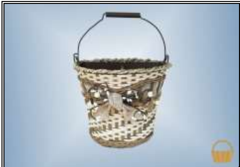
7 1/2" L X 5 1/2" W X 7" H w/o handle All Levels