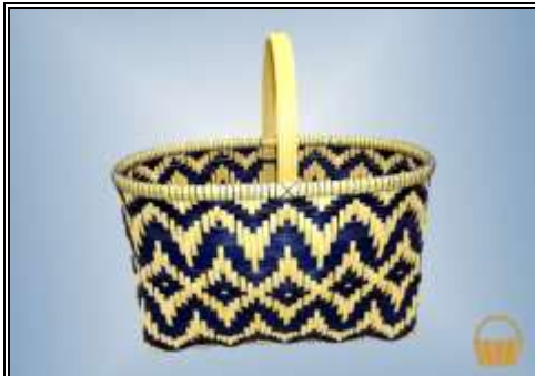
15" L X 10" W X 14" H w/handle Advanced

Class: FR-8-20 $ 115.00 Class: FR-8-20P $ 125.00 Friday 8:00-5:00 8 Hrs.