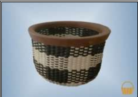
5" H X 5" D Advanced Beginner

Class: ST-6-32 $ 45.00 Saturday 8:00-3:00 6 Hrs.