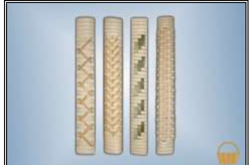
Sizes Vary All Levels

Class: SN-2-41 $ 40.00 Sunday 8:00-10:00 2 Hrs.