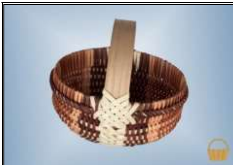
12" L X 12" W X 12" H w/handle Advanced

Class: ST-8-37 $ 65.00 Saturday 8:00-5:00 8 Hrs.