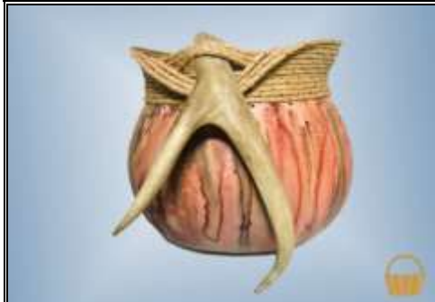
6" L X 6" W X 6" H X 6" D All Levels

Class: TH-4-4 $ 33.00 Thursday 1:00-5:00 4 Hrs.