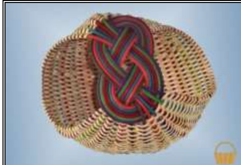
5" L X 5" W X 5" H w/handle Advanced Beginner

Class: ST-8-39 $ 78.00 Saturday 8:00-5:00 8 Hrs.