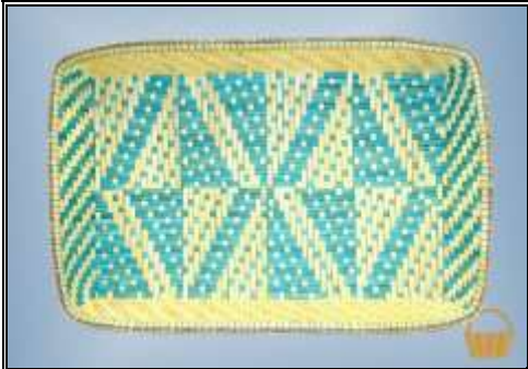
17 1/2" L X 12" W X 3" H Advanced

Class: ST-8-34 $ 115.00 Saturday 8:00-5:00 8 Hrs.