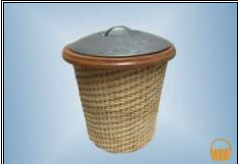
9" H X 7" D Intermediate

Class: FR-8-21 $ 220.00 Friday 8:00-5:00 8 Hrs.