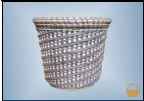
7 1/2" H X 9" D Intermediate

Class: FR-6-15 $ 38.00 Friday 8:00-3:00 6 Hrs.