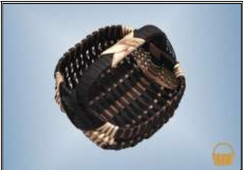
4" W X 4" H w/handle Intermediate

Class: TH-4-7 $ 55.00 Thursday 1:00-5:00 4 Hrs.