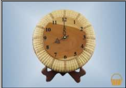
2 1/2" H X 9 3/4" D Advanced Beginner

Class: ST-8-33 $ 65.00 Saturday 8:00-5:00 8 Hrs.