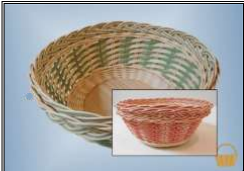
5" H X 12" D Intermediate