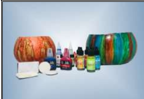
6" L X 6" W X 6" H X 6" D All Levels

Class: ST-8-40 $ 45.00 Saturday 8:00-5:00 8 Hrs.