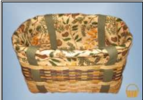
12" L X 8" W X 6 1/2" H Beginner