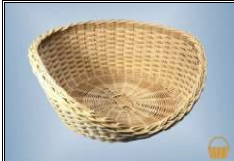
6" H X 13" D All Levels

Class: ST-6-29 $ 52.00 Saturday 8:00-3:00 6 Hrs.