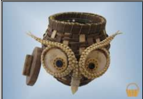
6 1/2" L X 6 1/2" W X 6 1/2" H X 6 1/2" D Advanced Beginner

Class: FR-4-14 $ 70.00 Friday 1:00-5:00 4 Hrs.