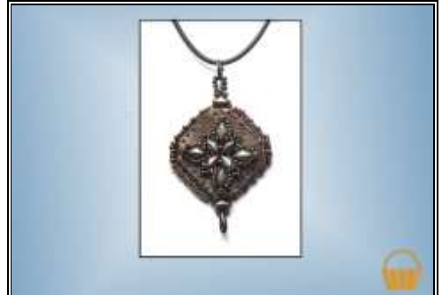
2" W X 2 3/4" H All Levels

Class: ST-6-31 $ 45.00 Saturday 8:00-3:00 6 Hrs.