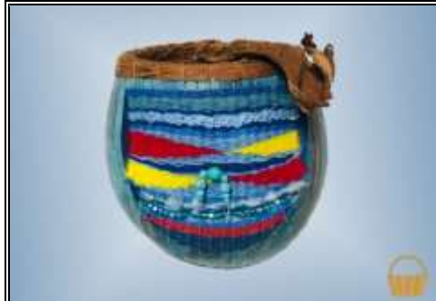
6" L X 5" W X 6" H X 6" D All Levels