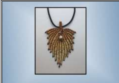
Sizes Vary Advanced Beginner

Class: TH-FR-12-9 $ 100.00 Thursday 1:00-5:00 12 Hrs. Friday 8:00-5:00