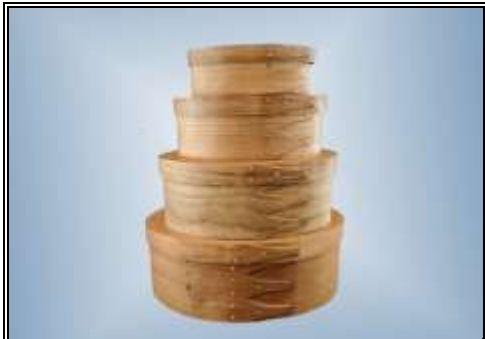
8 1/2" L X 5 3/4" W X 1 1/2" - 4" H All Levels