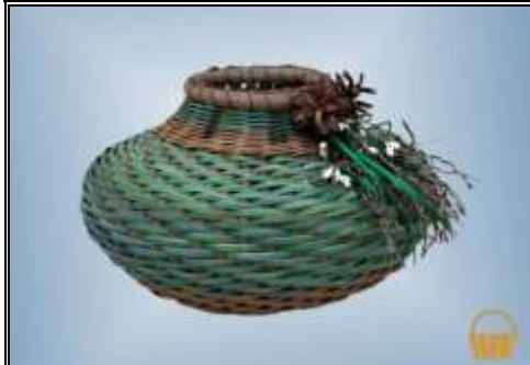
6" H X 9 1/2" D Intermediate