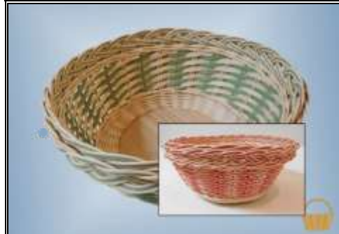
5" H X 12" D Intermediate

Class: ST-6-30 $ 50.00 Saturday 8:00-3:00 6 Hrs.