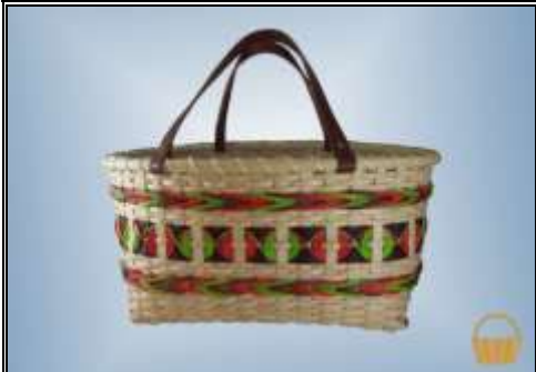
17" L X 12" W X 12" H w/o handle Intermediate

Class: TH-4-8 $ 42.00 Thursday 1:00-5:00 4 Hrs.