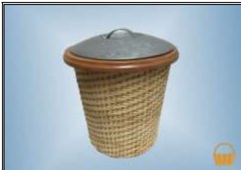
9" H X 7" D Intermediate