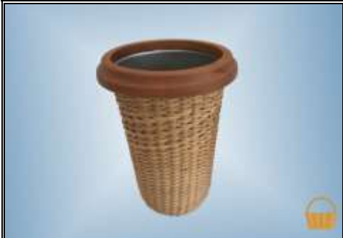
8" H X 4" D Beginner

Class: SN-4-43 $ 20.00 Sunday 8:00-12:00 4 Hrs.