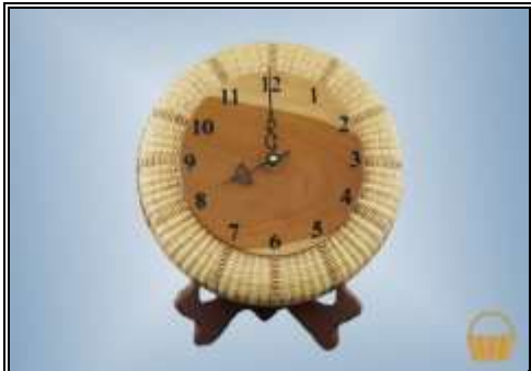
2 1/2" H X 9 3/4" D Advanced Beginner