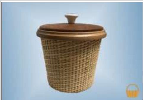
9" H X 7" D Intermediate

Class: ST-8-34 $ 115.00 Saturday 8:00-5:00 8 Hrs.