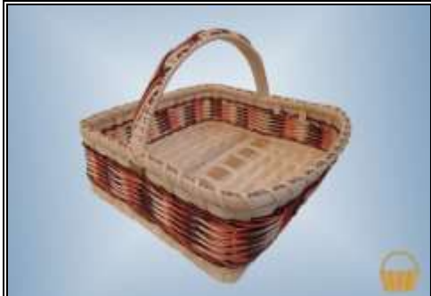
14 L X 14 W X 10 H w/handle Intermediate