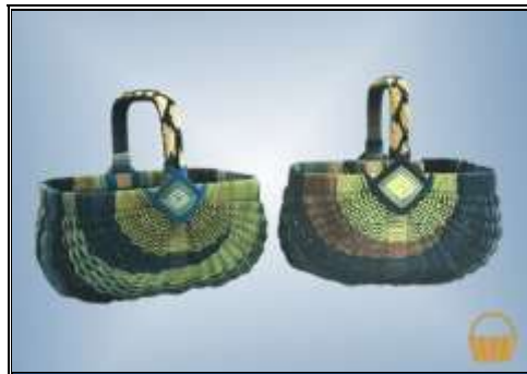
10" W X 10" H w/handle Advanced

Class: ST-4-27 $ 80.00 Saturday 1:00-5:00 4 Hrs.