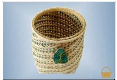
13" H X 8" D Intermediate

Class: ST-SN-10-28 $ 125.00 Saturday 8:00-5:00 10 Hrs. Sunday 8:00-10:00