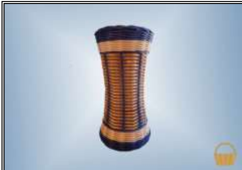
9" H X 4" D Intermediate

Class: TH-4-5 $ 70.00 Thursday 1:00-5:00 4 Hrs.