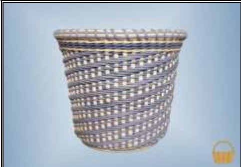
7 1/2" H X 9" D Intermediate

Class: FR-6-15 $ 38.00 Friday 8:00-3:00 6 Hrs.