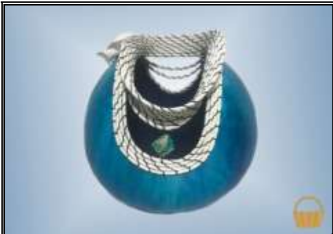
8" L X 8" W X 9" H X 10" D All Levels

Class: TH-ST-14-12 $ 125.00 Thursday 11:00-5:00 Saturday 8:00-5:00 14 Hrs.