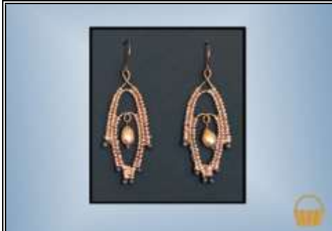
3/4" W X 2" H All Levels

Class: SN-4-44 $ 60.00 Sunday 8:00-12:00 4 Hrs.