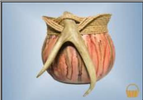
6" L X 6" W X 6" H X 6" D All Levels

Class: TH-4-1 $ 42.00 Thursday 1:00-5:00 4 Hrs.