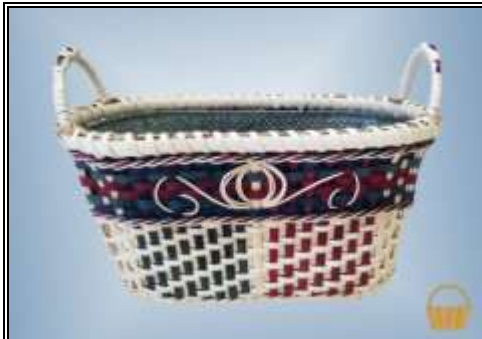
11 1/2 L X 6 1/2 W X 7 1/2 H w/handle Intermediate

Class: ST-8-36 $ 95.00 Saturday 8:00-5:00 8 Hrs.