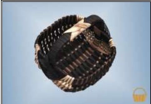
4" W X 4" H w/handle Intermediate

Class: TH-4-6 $ 40.00 Thursday 1:00-5:00 4 Hrs.