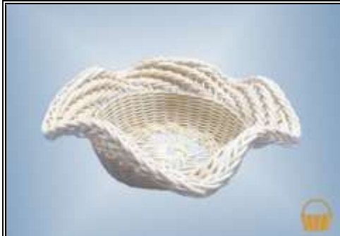
3 1/2" H X 8" D Intermediate

Class: FR-6-16 $ 44.00 Friday 8:00-3:00 6 Hrs.