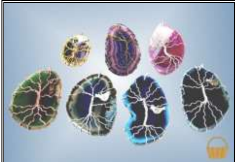
3" L X 2" W All Levels

Class: ST-8-39 $ 78.00 Saturday 8:00-5:00 8 Hrs.