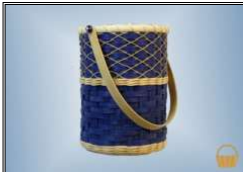
10" H X 7" D w/o handle Intermediate