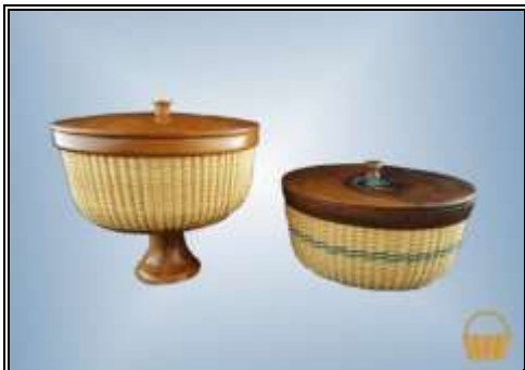
4 1/2" H X 7" D Advanced Beginner