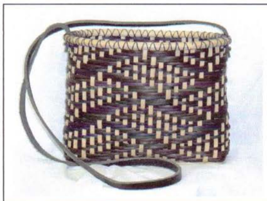
10" x 5" x 8"

Note: Before beginning, determine if you will be shimming or gluing the spokes. Due to the straight sides of the base you will need to do one or the other. I glued the dry spokes into the base then sprayed with water the next day to dampen them for weaving.